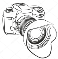
Photo Booth Official Photographer

Student registration and compliance forms will be sent home Monday, April 19. Payment for the event will be due with the form on or before the May 14th deadline.